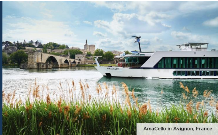
AmaCello in Avignon, France

7-night cruise from Dijon to Arles September 5-12, 2024 | AmaCello