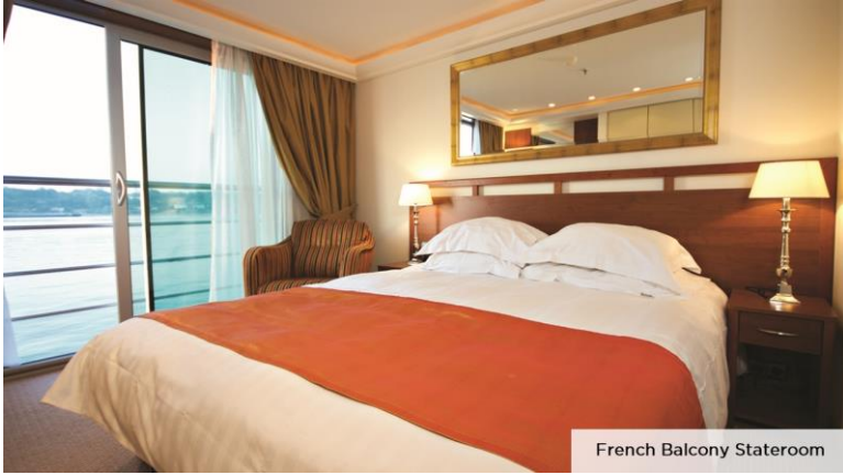
French Balcony Stateroom

7-night cruise | September 5-12, 2024 | Aboard AmaCello