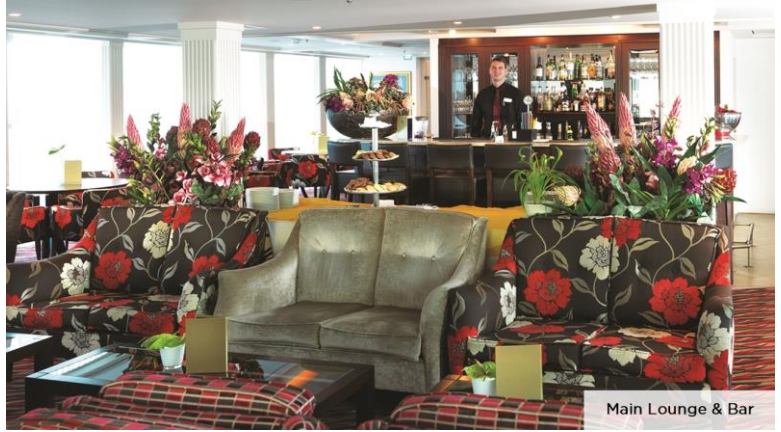
Main Lounge & Bar